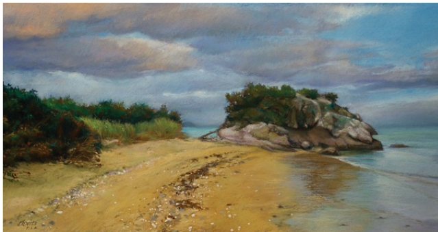
'Rock of Ages'