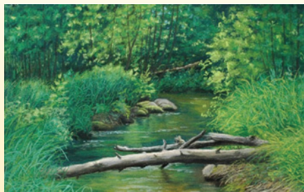
"Willow Creek" © Susan Klabak

"There is an undeniable urgency when painting outdoors – nature's so grand, the canvas so small. It takes the human mind with all its grand abilities and complexities to sort through the overwhelming visual feast set before it and re-create on canvas the essential components of such beauty and wonder.."