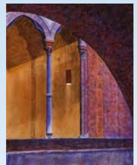
"Like a Geode"

My technique almost always involves some type of underpainting, followed by multiple finishing layers. I normally use Wallis museum paper because of its tough, forgiving nature, but Arches cold-pressed watercolor paper with a medium-thinned acrylic under-painting also makes a nice working surface. I like the softest of the soft pastels.