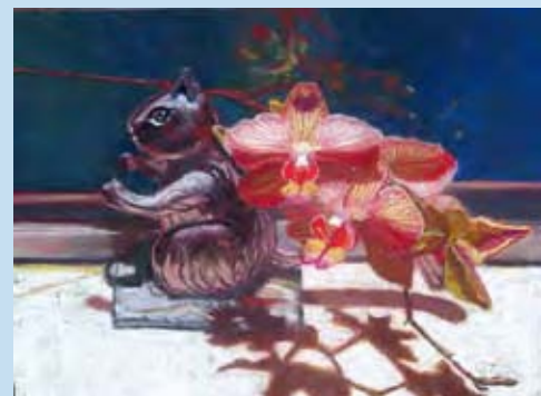
"Squirrel's Burden"