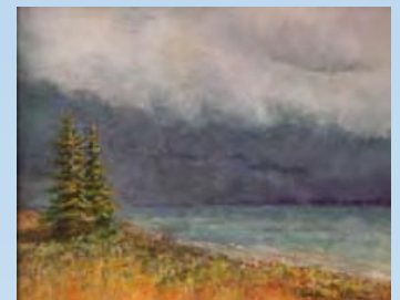
"Storm at St. Martin's Bay"

of Mackinac Island. We love travel and photography, but photographs no longer seem adequate to me. It usually takes a painting to say something with real depth. When I'm not painting in plein air, I do use our photographs, but only if they can transport all my senses back to where they were taken.