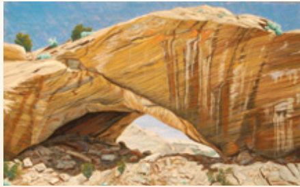
"Phipp's Arch "

"We must not be too ambitious. We cannot aspire to masterpieces. We may content ourselves with a joy ride in a paint box. And, for this, Audacity is the only ticket. "