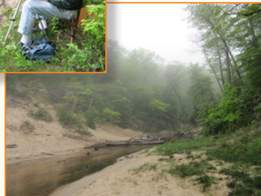
Lots of Fun and Painting at the Hoffmaster State Park Paint Out – See Page 6 for Recap