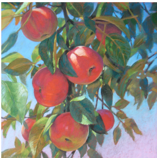
"Orchard 1"